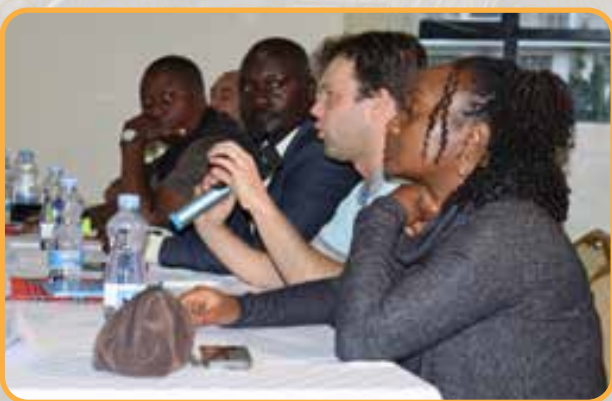
One of the Judges of the 2022 climathonke by KCIC Consulting Limited - KCL that brought together 100 participants