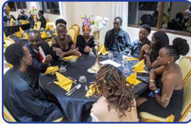
During SES Dinner 2026