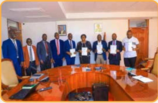
Member of "Pending Bills, Lands and County Assets Verification Taskforce" of the County Government of Homa Bay